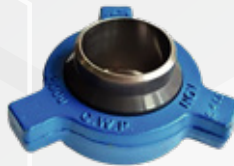
FIG. 602 THRD