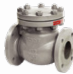
Fig. 1118F / 1318 F / 1618F

Cast Steel A-216 Gr. WCB API 600 API TRIM 8 ASME B16.34 RF Ends Class: 150 / 300 / 600 Sizes: 2" - 24"