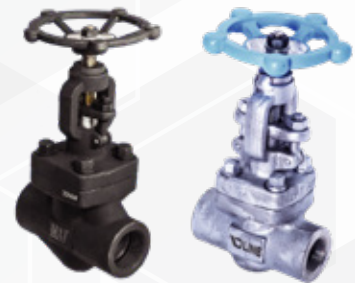
Fig. 3828T / 3831T