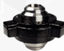
FIG. 1502 THRD