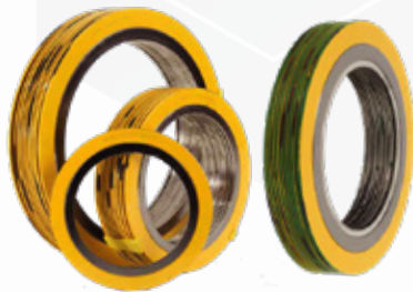
ASME B16.20 Stainless Steel 304L & 316L Filler Graphite Class: 150 / 300 / 600 Sizes: 1/2" - 36"