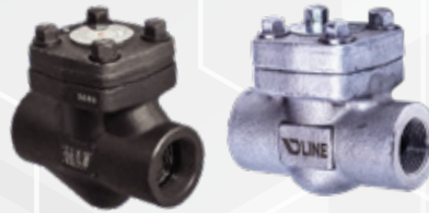
Fig. 2828T / 2831T