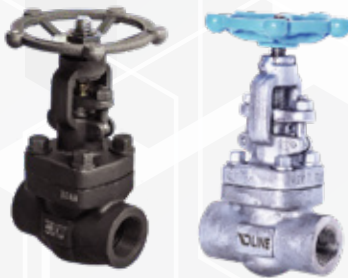
Fig. 1828T / 1831T