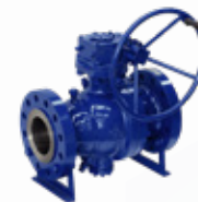
Fig. 5112TF/ 5312TF/ 5612TF

A-216 WCB Body Full Port API 6D / API 608 NACE MR - 0175 316SS TRIM ASME B16.10/B16.5 Sizes: 1" - 12"