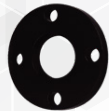
Carbon Steel SA/A-105 ANSI B16.50 Class: 125 / 150 Sizes: 2" - 24"