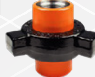
FIG. 602 BW