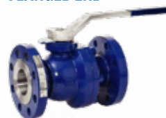
Fig. 5112FF/ 5312FF/ 5612FF