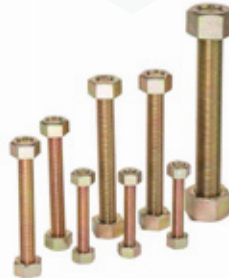
Carbon Steel A-193 Gr.B7 & A-194 Gr.2H Zinc plated coating Diameters: 1/2" - 1 7/8" Length: 2 1/2" - 15 1/2"